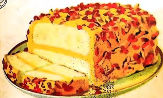
RUSSIAN ROLL (RECIPE PAGE 12)