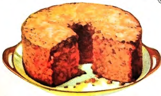
CHOCOLATE SPONGE CAKE (RECIPE PAGE 6)

If the fire is too hot, lower the heat; or place a baking tin containing hot water in the oven, but do not move the cake.