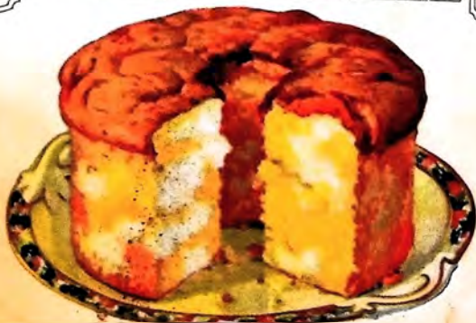
SWANS DOWN ANGEL SPONGE (RECIPE PAGE 12)